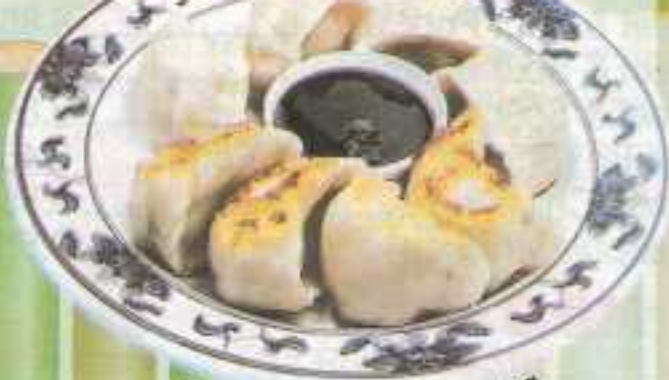
Fried or Steamed Dumpling

All Served w. Roast Pork Fried Rice From 11:00 am - 3:00 pm