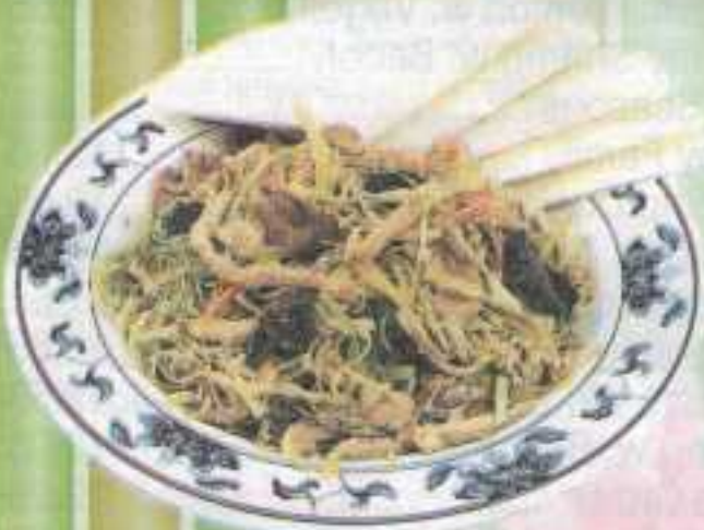
Moo Shu Pork